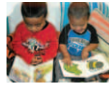
RCMA recognized by RIF 3