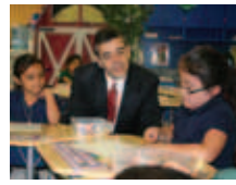
US Rep David Rivera visits 2