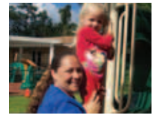
An appreciative parent 5