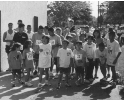
Charter School students readying for the race.

On your mark, get set, go... these words started off the 9th Annual Wendall N. Rollason 5K Scholarship Run held at the Immokalee Community Park. Under blue skies and with a cool breeze at their backs, 125 runners made their way along the route, some trying to beat their best time, others attempting their first 5K.