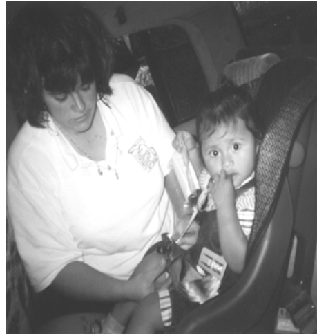
The instructor demonstrates the proper steps in securing a child in a car seat, while parents observe.

At our Farmworker CDC in Delray, our parents were busy with the "Corazon de mi Vida" event, which was sponsored by the National Latino Chil-