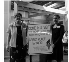
Parkview Child Development Center