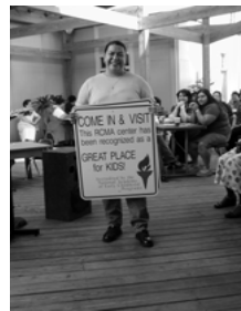
LaBelle Child Development Center