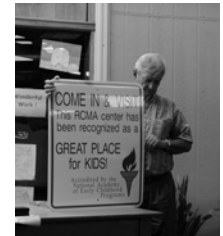
Mira Verde Child Development Center