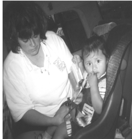
La instructora demuestra los pasos en como asegurar la niña mientras los padres observan.

En el centro Farmworker CDC de Delray, los padres participo en el evento “Corazón de mi vida”,