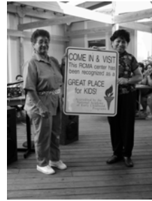
Estancia Migrant Head Start