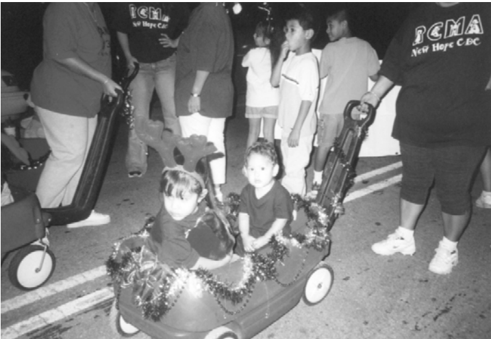
Children and parents of the New Hope CDC come together to participate in a community parade.

The parents of our New Hope CDC, participated in the "Christmas in Pahokee USA Parade". The parent committee met and agreed that they wanted RCMA to be represented this year and show parents and children working together. They decorated children's wagons in which two RCMA children rode. There were a total