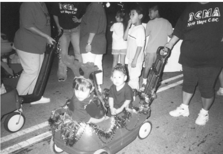
Los niños y padres de RCMA New Hope en un desfile.

Los padres del centro de New Hope CDC, participaron en el evento “La Parada de las Navidades en Pahokee, USA”. El comité de padres se reunió y decidió que querían ver a RCMA participar y tener el orgullo de mostrar a padres e hijos trabajando juntos. Cuatro carritos con dos niños en cada uno fueron