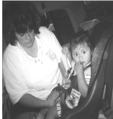
The instructor demonstrates the proper steps in securing a child in a car seat, while parents observe.

At our Farmworker CDC in Delray, our parents were busy with the "Corazon de mi Vida" event, which was sponsored by the National Latino Chil-