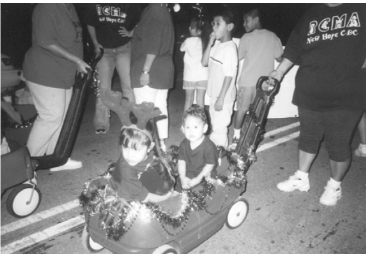
Children and parents of the New Hope CDC come together to participate in a community parade.

The parents of our New Hope CDC, participated in the "Christmas in Pahokee USA Parade". The parent committee met and agreed that they wanted RCMA to be represented this year and show parents and children working together. They decorated children's wagons in which two RCMA children rode. There were a total