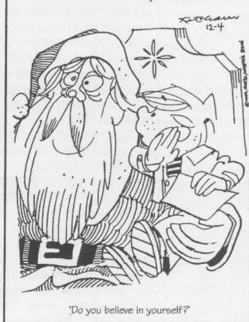
DENNIS THE MENACE By Ketcham