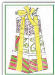
E10 Esner, Wimauma