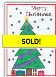
E17 Greydis, Wimauma