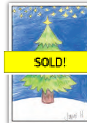
E15 Javier, Wimauma