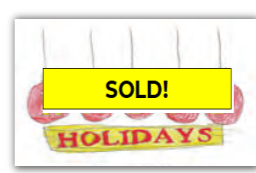
E36 Artist unknown