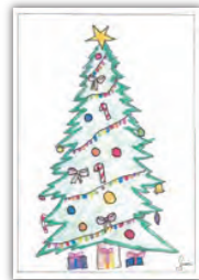
E8 Allison, Wimauma