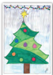
E11 Yiselle, Wimauma