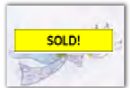
E32 Ashyia, Immokalee