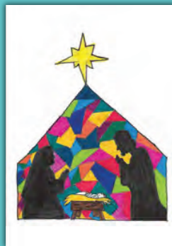
G1 Alexandra, Wimauma May peace, joy and happiness bless your holiday season

Enjoy these 3 designs from our general selection of non-exclusive Christmas cards. Each $15 package contains 10 cards with envelopes. See order form for details.