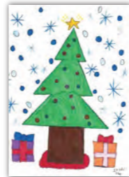
E2 Itzel, Wimauma