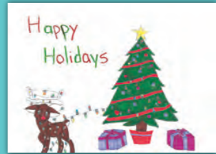
G2 Kimberly, Wimauma May your holidays be warm and bright