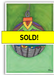
E1 Yahir, Immokalee

Proceeds from this year's sales will be included in the Ring the Bell: be the difference capital campaign to build a state-of-the-art Dual Language K-8 charter school in Mulberry, FL. Your support will elevate resources and holistic development for hundreds of children and families.