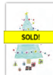
E13 Giselle, Balm CDC