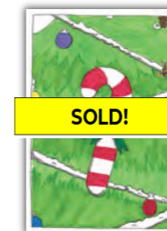
E14 Melanie, Wimauma