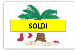
E38 Belinda, Wimauma