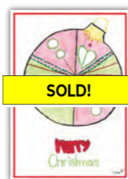
E12 Lexy, Wimauma