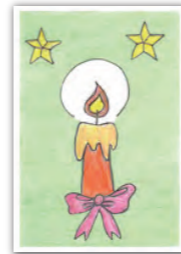
E3 Jazlyn, Wimauma