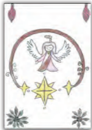
E19 Oscar, Wimauma